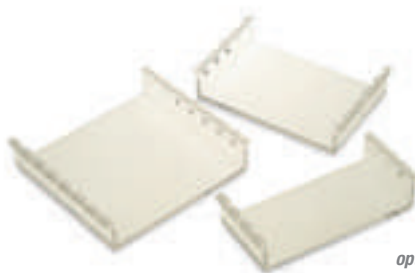
multiSUB Choice Trio includes all 3 tray sizes for optimum versatility and value

low cost gel documentation system, see page 27