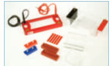
components of multiSUB Mini Duo